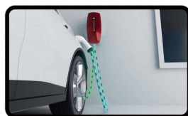
PEN FAULT DETECTION