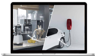
DYNAMIC LOAD BALANCING